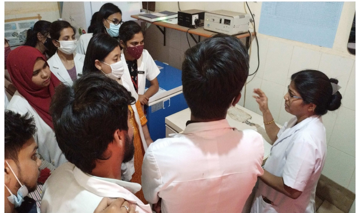
Primary Health Centre