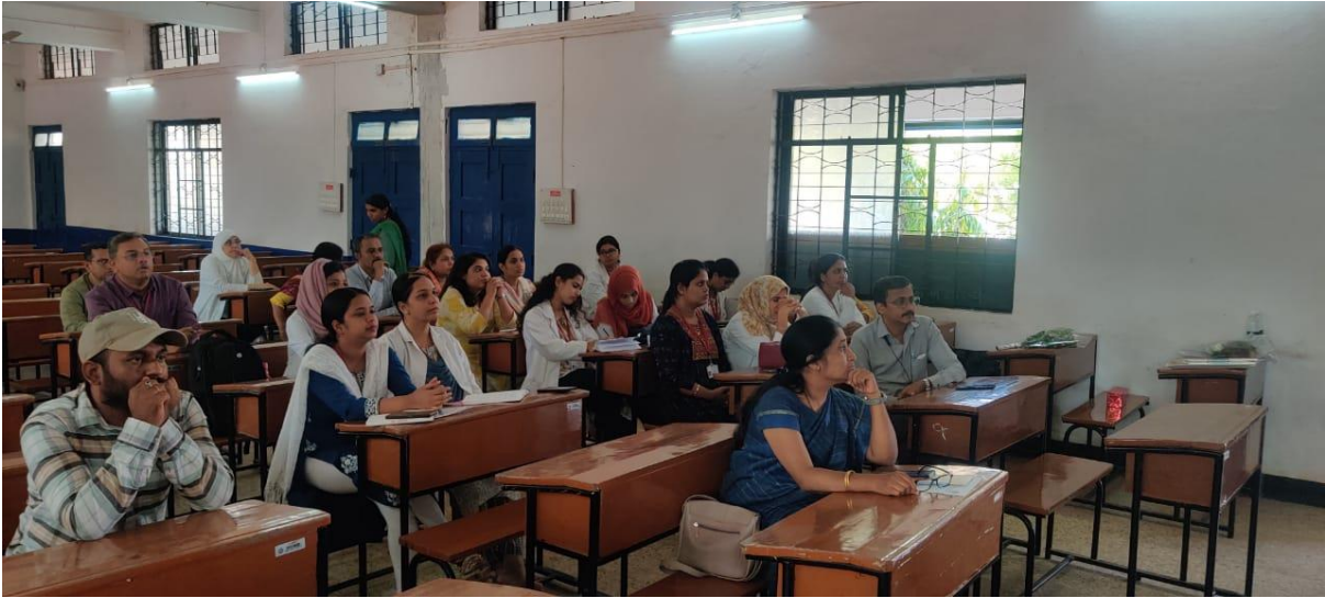
Participants of workshop